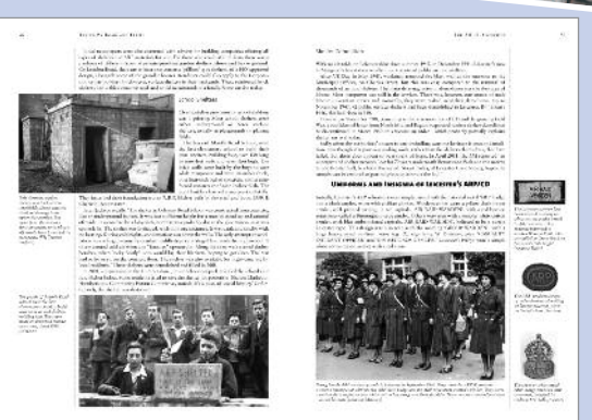
By 1942, 50,000 shelter passes were allocated to Leicester residents.